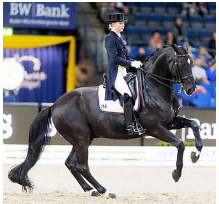
Image 1. The canter pirouette is the end result of many years of gymnastic and collection training seen here as a light slow motion very collected cadence elevated canter that turn on the hindquarters in a clear three beat striding.

Remember, horses like people are what we think we are? Whether it is too hard or not it matter little, if