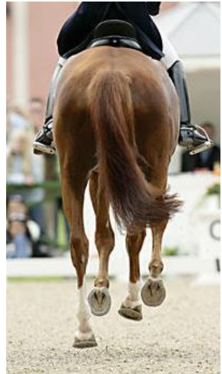
Image 6. Shoulder-fore here in canter is where the inside hindleg can be seen between the forelegs and is often referred to as 4 tracks

We ride ( as do the many really good riders trainers internationally ) shoulder-fore every with the only time where we ride straight is in the tests, shoulder-fore is also to be ridden in canter and trot.