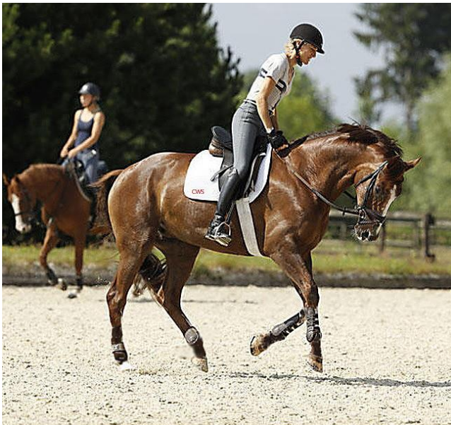
Image 3. Tenzign C learning collected trot to half steps in rising trot to keep his swing

Rideability comes first , it always comes first, and then we concern ourselves with additional follow on exercises and then to the movements. The movements are the end game or benchmark only in order to see how well your horse is trained. Rideability means that your horse responds instantly to your seat, leg forwardly or laterally ( sideways ) and comes back to you initially from your hand then by way of a combination seat, leg and hand ( the half halt ). Once we have the elements in place then the upper movements come that much easier.