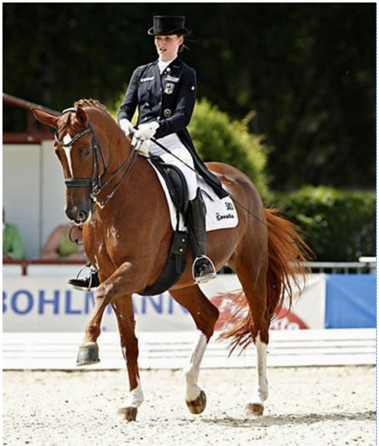
Image 1. The end result of many years of training is a light slow motion very collected cadenced elevated trot called passage

You don't want to look at the next level and think "OMG" I have to learn to do flying changes by next month as I'm going up another level. You have to plan ahead and deploy the early elements much earlier otherwise it is just too late and you are going to have faults!