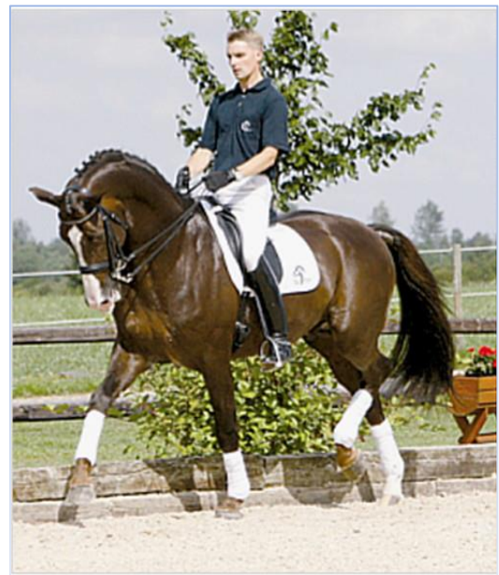
Image 2. Denmark's Andreas Helgstrand developing the collected trot towards half steps

Passage is like any of the collected work, it is very progressive and takes a long time to develop and master as you do with Piaffe.