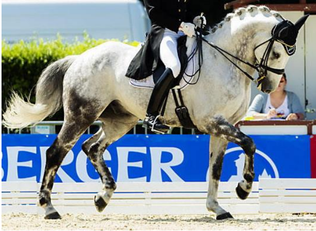
Image 5. Good example of trailing out behind hindlegs subsequently horse is on the forehand

Firstly teach piaffe, then passage whereby the horse has to be really in front of the leg, sitting by way of taking the weight behind.