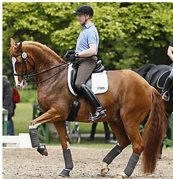
Image 4. Starting early piaffe 2-3 forward steps at a time

As a rule we start horses with half steps at six or seven years or the 3rd and 4th year of training depending on the horse and we definitely start later with our own riders. Then once we have developed 6 or 7 honest small steps in piaffe ( smaller steps 2-3 to begin with -- not 6 or 7 in one go ) we then start to develop passage thus avoiding the common problem of trailing the hindquarters that often occurs when training passage first.